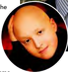
Three years on, Shea is doing well