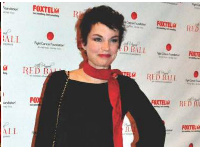
Sigrid Thornton unmasked