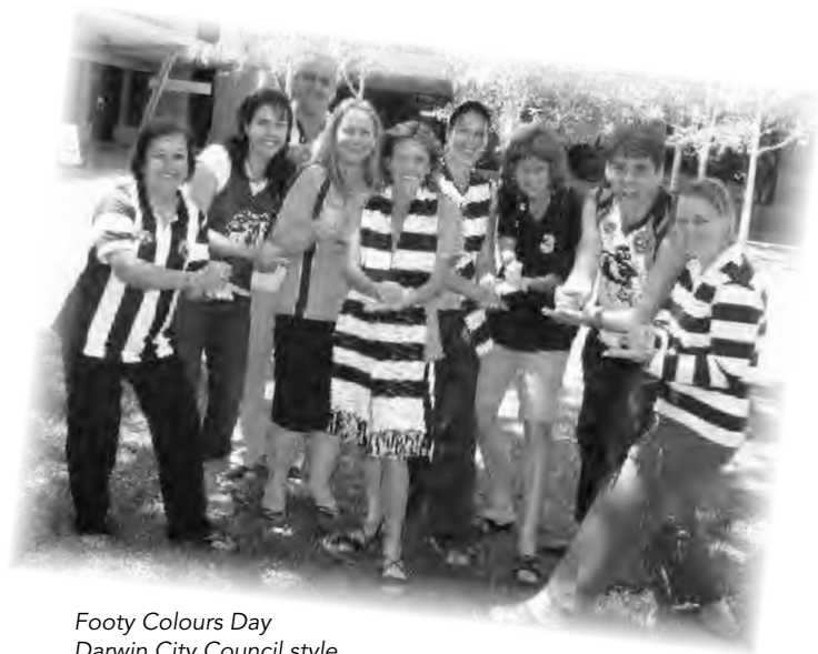
Footy Colours Day Darwin City Council style...

Hundreds of schools hosted this special day to raise funds for children less fortunate than themselves. Aged care facilities got into the spirit with residents wearing their favourite team colours and making a gold coin donation. Many of the companies who joined in matched their employee contributions, which really made a mark!